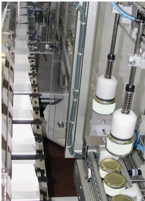
Vial feeding in intermittent mode